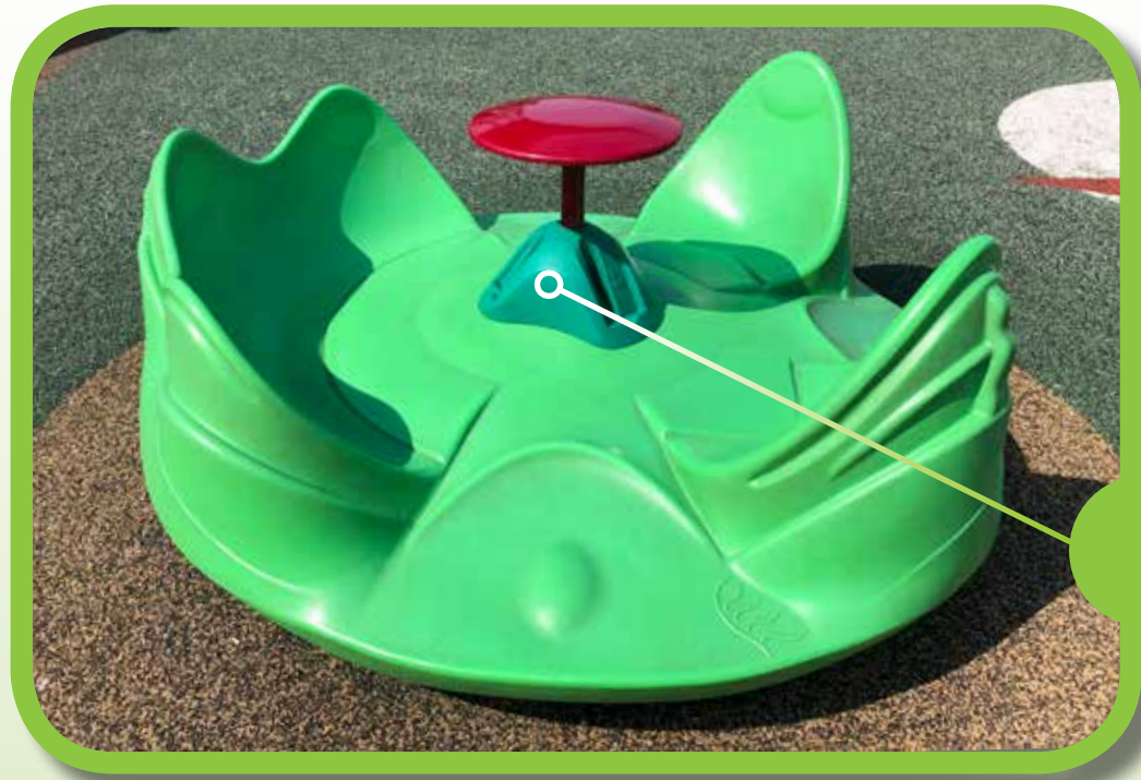
Shown with optional Center Wheel