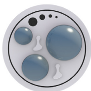
12.2 Bells AUDITORY