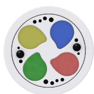
12.2 Color Wheel VISUAL