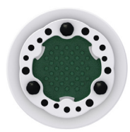
10.1 Pachinko VISUAL

12.1 - 12" One Sided 12.2 - 12" Two Sided 20.1 - 20" One Sided 20.2 - 20" Two Sided